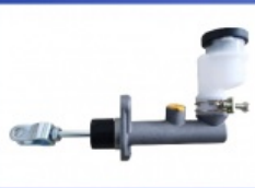
Clutch Master Cylinder