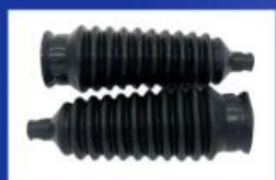
Steering Gear Boots