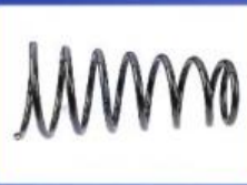
Shock Absorber Spring