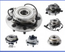
Wheel Hub Bearing