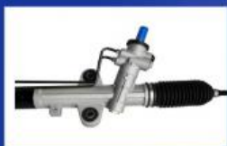
Power Steering Rack