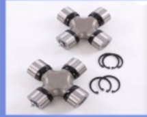
Universal Joint Bearing