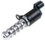
Oil Control Valve