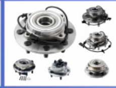
Wheel Hub Bearing