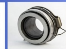
Clutch Release Bearing